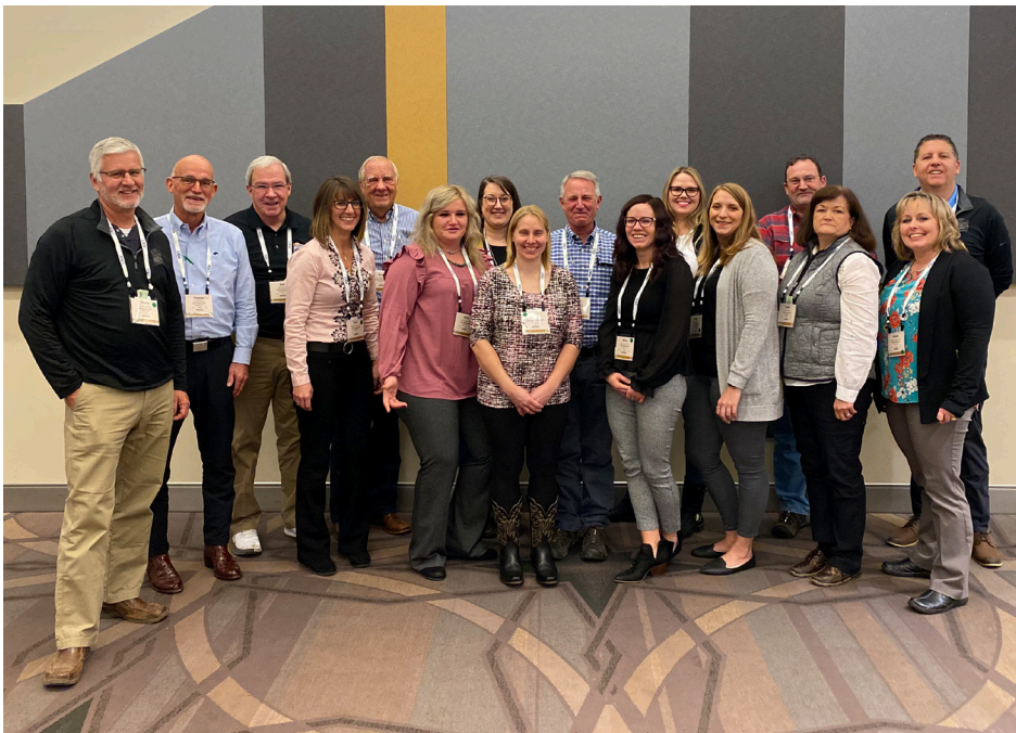
NY Delegation to the IAFE Convention, San Antonio, Texas